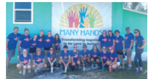
Des Moines Christian School, Des Moines, IA May 14-21 | People: 20