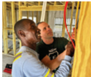
The Saunders family poses with an Impact team after a day of hard work renovating their house.