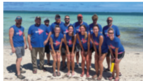
Celebrate Church, Knoxville, IA June 4-11 | People: 13