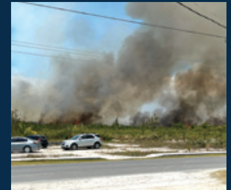
Fires burn as onlookers watch from their cars.

In recent weeks, Abaco has faced a relentless battle against widespread bush fires. For 18 days, the fires ravaged hundreds of acres across multiple communities, including but not limited to Spring City, Marsh Harbour, Murphy Town, Dundas Town, Central Pines, Great Cistern, and Bahamas Coral Island. The flames continued to spread northward and southward along the major highway of S.C. Bootle.