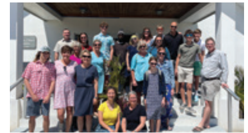
Kraal's Michigan Team & Trinity Church April 2-8 | People: 21