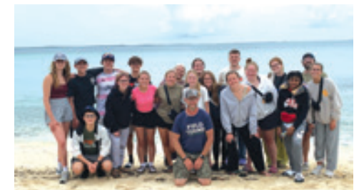
Convoy of Hope, Germantown, WI June 15-22 | People: 20