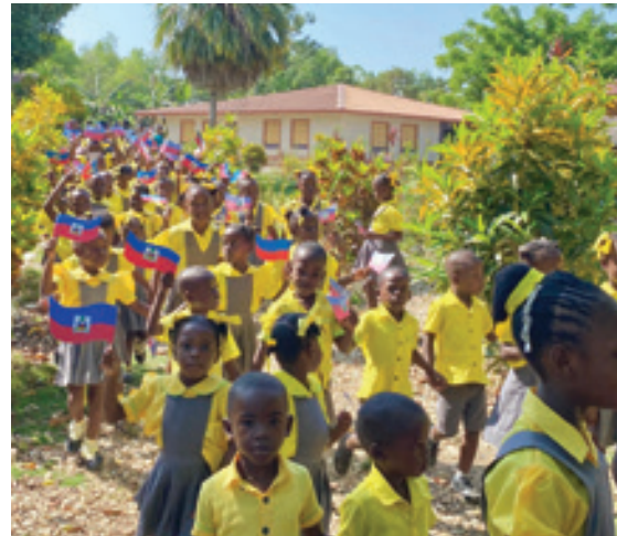
Photos: School of Light students celebrate Flag Day on Many Hand's Campus.