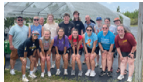
Lutheran Church of Hope Ames - Kairos May 14-21 | People: 15